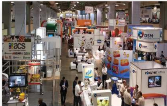
Figure C XXIV Panama's National Poultry Summit