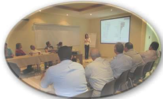
Figure A Market study presentation