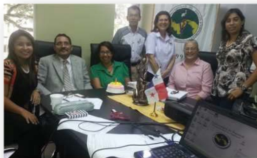
Figure B Technical meetings